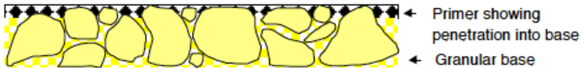
Figure 1 Prime

DBST comprises a first surface treatment followed by a second surface treatment using smaller chippings (Figure 3). The required chipping size depends upon the traffic which will use the road and the strength of the underlying layer.